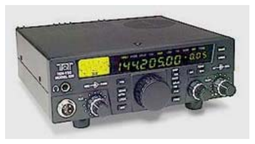
Ten-Tec model 526 "6N2" all-mode VHF transceiver, as used by N2CBH, covers six meters and two meters.

mode. For an antenna I use a home brewed dipole. With this set up I have made contacts to Europe and the west coast of the U.S. I have also made maritime mobile con-