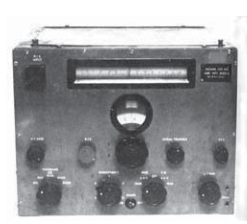
World War II vintage B28 receiver, manufactured by Marconi for the British Admiralty.

The receiver is an interesting combination. I have an ex-World War II B28/CR100 naval receiver made by Marconi (not Guglielmo Marconi himself – but by Marconi's Wireless Telegraph Company). I've modified the receiver with a product detector for single sideband reception and an S-meter operating off the AGC line. The receiver has variable I.F. bandwidth and performs